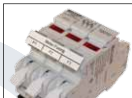
Continuous marking strip and adaptors

* USCMA required for use with USCM0 and USCM1